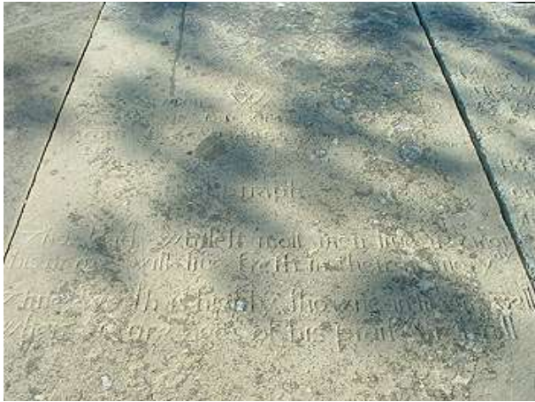
"Augustine Warner Deceased ye 24th of December 1674 Aged 63 years 2 Mth 26 Da"

"Tho dead whilest most men live he canot dy His name will live fresh in their memory True worth is highly shown in liveing well when future ages of his praise shall tell."