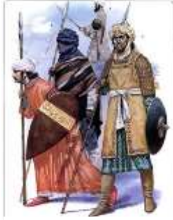
Figure 8 Fatimid soldiers