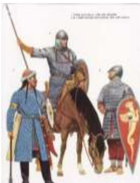
Figure 7 Seljuk soldiers

MUSLIM is an Arabic word meaning "submitter" (to God).