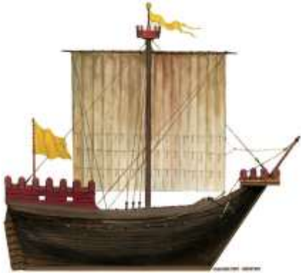
Figure 1 Cog

The Clinker was another name for the Cog (In French and English), Kogghe (in Batavian), Koggen (in German) or “Coque”, from the Spanish Coca or Cocha, or Concha in Latin, Coccha in Venetian. This was typical of the versatile cargo ships of northern Europe between the early Middle Ages and the era of great discoveries. Classical kogges primarily used primarily in the Baltic by the rich merchant cities of the Hanseatic League united in 1241, were built in oak with ash couples, and with a deck clearing a large hold. Quickly adopted by the English who also produced a local version of the nava, the Roundhip Cog had a raised platform for archers and a small front forehead almost always rectangular. The stern post was almost straight, supporting a large rudder with straight bar, the transverse lever system only appearing much later. The hull was quickly adopted in the Mediterranean, with local constructions, such as the freeboard, and a rounded bow instead of right. This ship dominated trade waterways for three centuries as an all-purpose do-it-all ship.