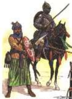
Figure 9 Mamluk soldiers

The Fatimid Caliphate (909-1171) was based in Egypt and relied heavily on mercenary troops but their vast wealth ensured they could field very large armies of reasonably well-trained and well-equipped infantry which included contingents of Sudanese archers. Cavalry was usually composed of a mix of scimitar-wielding Arabs, Bedouins and Berbers. The Fatimid army might have been the best in the Muslim world of the time but they were somewhat off the pace compared to the Crusaders in terms of weapons, armor and tactics; their successors the Ayyubids, though, would soon catch up.