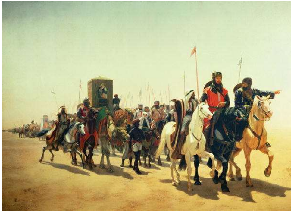
Figure 12 A 19th century painting depicting Richard I (r. 1189-1199) leading the march of the Crusader army to Jerusalem during the Third Crusade (1189-1192)

Logistics has always been a crucial aspect of warfare that can spell defeat or win victory regardless of an army's fighting skills and a commander's knowledge of strategy. Unfortunately for the Crusaders, medieval Europe had long since lost the skill of battle logistics, those having disappeared following the demise of the Romans. The skills would have to be relearned in the Middle East, especially so considering the often harsh and arid climate and terrain where living off the land was usually not an option. Many a Crusader army was defeated simply because it could not find adequate food and water and men died of scurvy or starvation. Another frequent killer was bacterial disease, especially rife in the filthy army camps of siege armies which typically lacked adequate sanitation, clean water and treatment of the dead.