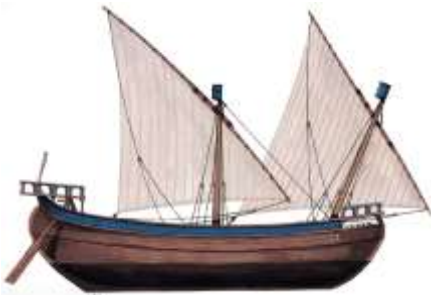
Figure 2 Nava

The Clinker was another name for the Cog (In French and English), Kogghe (in Batavian), Koggen (in German) or “Coque”, from the Spanish Coca or Cocha, or Concha in Latin, Coccha in Venetian. This was typical of the versatile cargo ships of northern Europe between the early Middle Ages and the era of great discoveries. Classical kogges primarily used primarily in the Baltic by the rich merchant cities of the Hanseatic League united in 1241, were built in oak with ash couples, and with a deck clearing a large hold. Quickly adopted by the English who also produced a local version of the nava, the Roundhip Cog had a raised platform for archers and a small front forehead almost always rectangular. The stern post was almost straight, supporting a large rudder with straight bar, the transverse lever system only appearing much later. The hull was quickly adopted in the Mediterranean, with local constructions, such as the freeboard, and a rounded bow instead of right. This ship dominated trade waterways for three centuries as an all-purpose do-it-all ship.