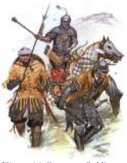
Figure 11 Ottoman Soldiers

By the end of the 14th century, a new foe was identified as a legitimate target for a Crusade: the Ottoman Turks. The Ottomans had two elite units of note. The Janissary Guards were a corps of infantry archers formed from conscripted Christians who were given military training from childhood. Secondly, the elite sipahis was a cavalry unit whose members were promised the right to estates and tax revenues for any success on the battlefield. The Ottomans also used gunpowder weapons from the 15th century. Some of their cannons were huge measuring 30 ft. in length and able to fire a ball weighing 1,100 lbs. over a distance of 1,600 yards.