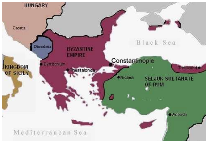
Figure 6 The Byzantine Empire c. 1090

By the 12th century the Byzantine Empire was in decline and its army reflected this situation by being mostly composed of mercenaries. Nevertheless, at the time of the First Crusade, the Byzantine emperor Alexios I Komnenos (r. 1081-1118) could muster an army of around 70,000 when required. In the early Crusades, the Empire did contribute to Crusader armies, providing its various units of mercenaries which included Turkish light cavalry, the Varangian Guards of Anglo-Saxon- and Viking descendants who wielded huge battle-axes, Serbs, Hungarians and Rus infantry.