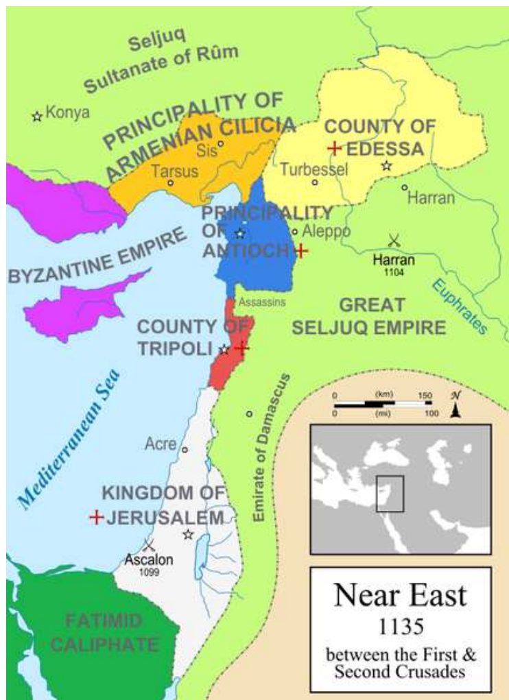
Figure 5 The Crusader States c. 1135