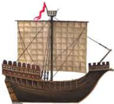
Figure 4 Hanseatic Nava

The Hanseatic Nava, or northern nava, probably appeared in the 12th century, first in the coastal cities of the North Atlantic, in the North Sea and then in the Baltic. It is the perfect illustration of the encounter in naval techniques of the north and the south, bearing in germs the future heavy European ships. While the southern, Mediterranean nave mingled Norman contributions of Scandinavian naval technique with the local Latvian ships, the northern nave saw it as a simple, finer and more graceful declination of line construction than the Kogges of transport in local use. As a result, the Nordic Nava was preferred as an armed transport ship or even a warship, as the heavy kogge. The lighter construction, however, lent less to offshore navigation than the Kogges, and in the end, Kogges and naves in the north were concurrent to develop their sails and lead to the carrack.