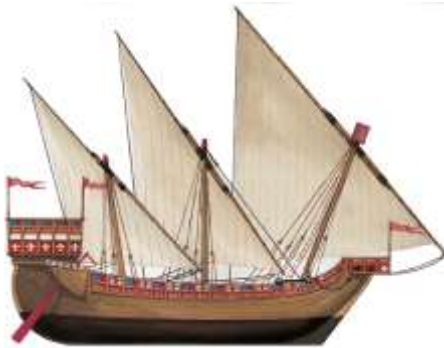
Figure 3 Crusader Nava

It was on these very special ships that the Crusaders landed in the Holy Land during the First Crusade. The Mediterranean Nave had a mixture of square and Latin sails, but some of them were even closer to the galleys.