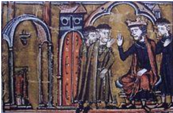
Figure 2 King Baldwin II of Jerusalem ceding the Temple to Hugues de Payens and Godfrey de Saint-Omer

After the Christian defeat at the Siege of Edessa, the pope commissioned Bernard to preach the Second Crusade. The last years of Bernard's life were saddened by the failure of the crusaders, the entire responsibility for which was thrown upon him. Bernard died at the age of 63, after 40 years as a monk. He was the first Cistercian placed on the calendar of saints, and was canonized by Pope Alexander III on 18 January 1174. In 1830 Pope Pius VIII bestowed upon Bernard the title "Doctor of the Church".